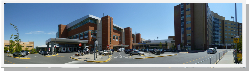
Royal Jubilee Hospital (VIHA), Victoria BC

Victoria Heart Institute Foundation and Royal Jubilee Hospital